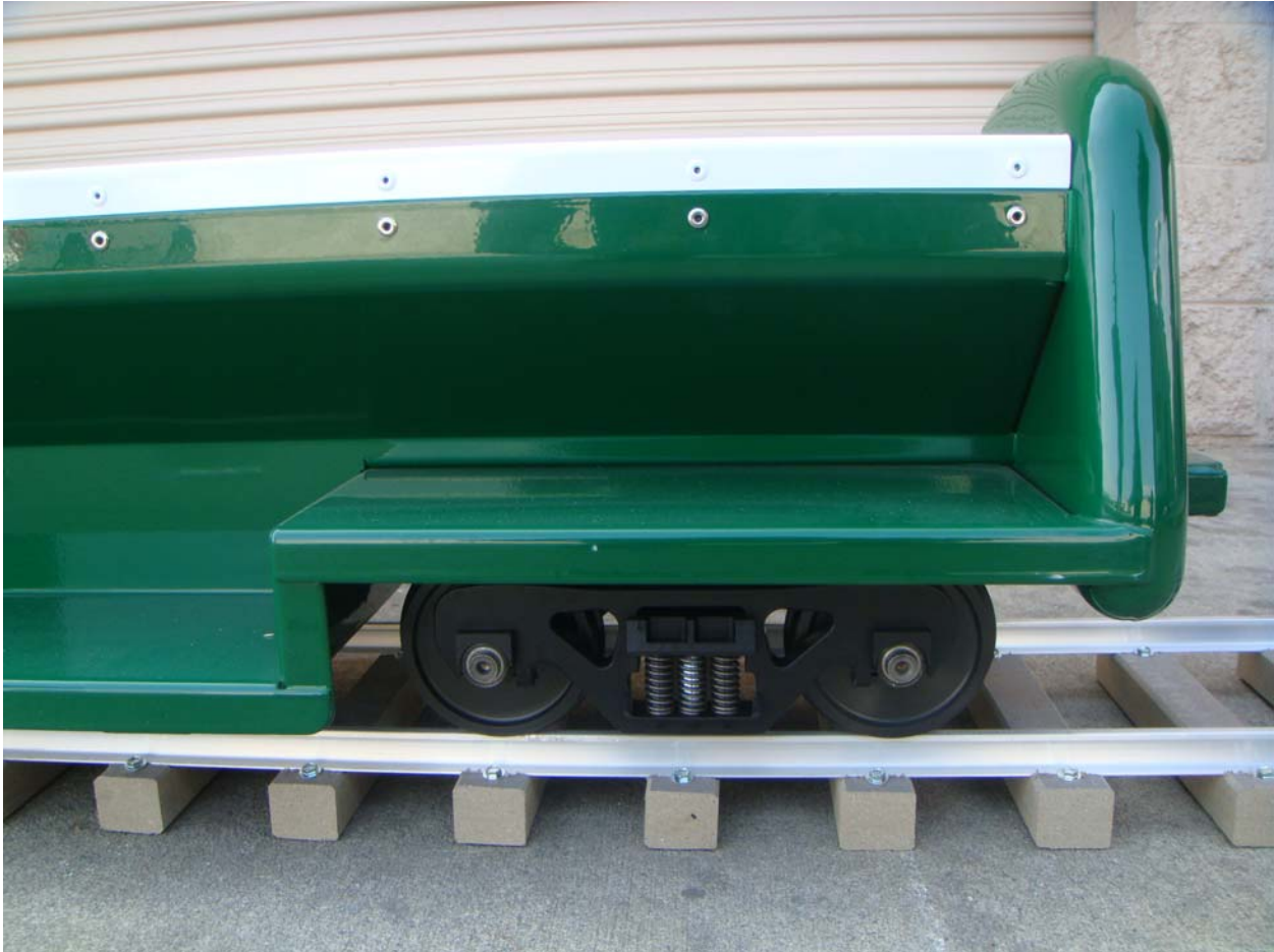
Trucks Shown For Illustration Only, Not Included

These cars are designed for maximum safety in hauling the public. Clubs that operate in parks must often deal with riders that are not experienced in riding and are sometimes difficult to