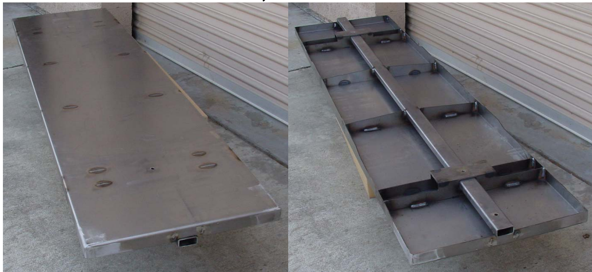
Bottom View Showing Structure

Car may be used as furnished as a work car - add seats for a riding car - or use as the basis for construction of any style car (all the metal work is done if you are a woodworker).