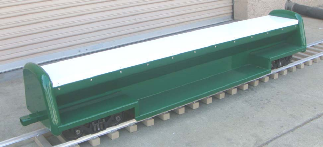
Trucks Shown For Illustration Only, Not Included