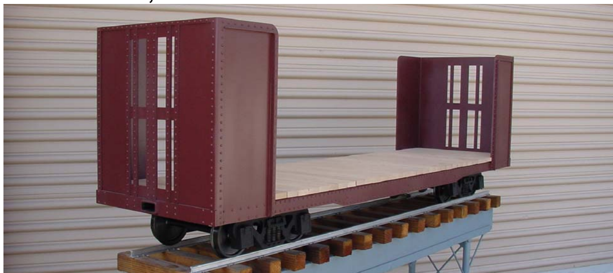
Trucks Shown For Illustration Only - Not Included

This car is a perfect scale model of a car used to haul cordwood for the paper manufacturing industry. It was commonly used during most of the modern steam and diesel eras. The design allows for easy conversion to a center bench riding car, needing only the seat to be added.