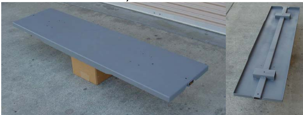
Bottom View Showing Structure

Car may be used as furnished as a work car - add seats for a riding car - or use as the basis for construction of any style car (all the metal work is done if you are a woodworker).