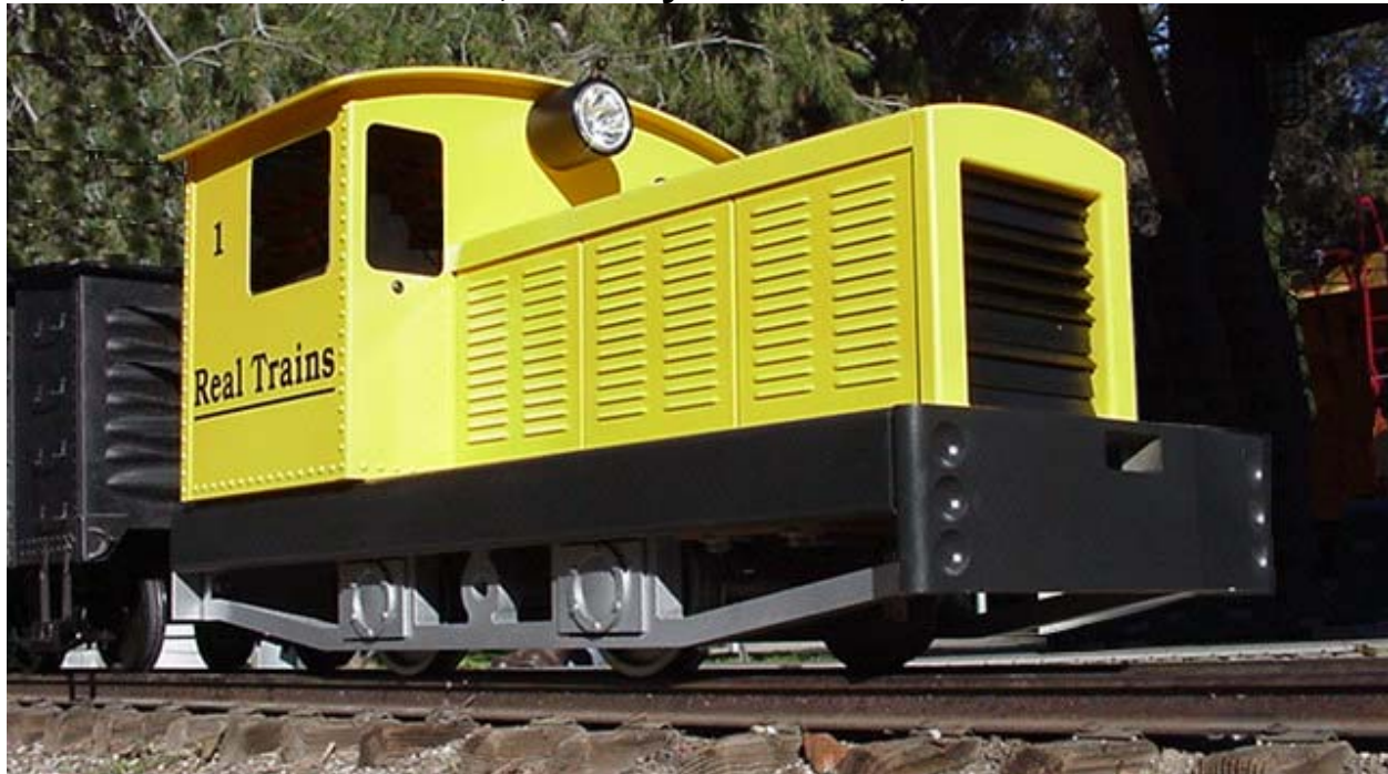
Some Items Shown are Optional at Extra Cost

A highly affordable first locomotive for someone new to the hobby. Also popular for work trains or as a less complex alternative for that junior engineer in the family. Designed to last for years with little maintenance.